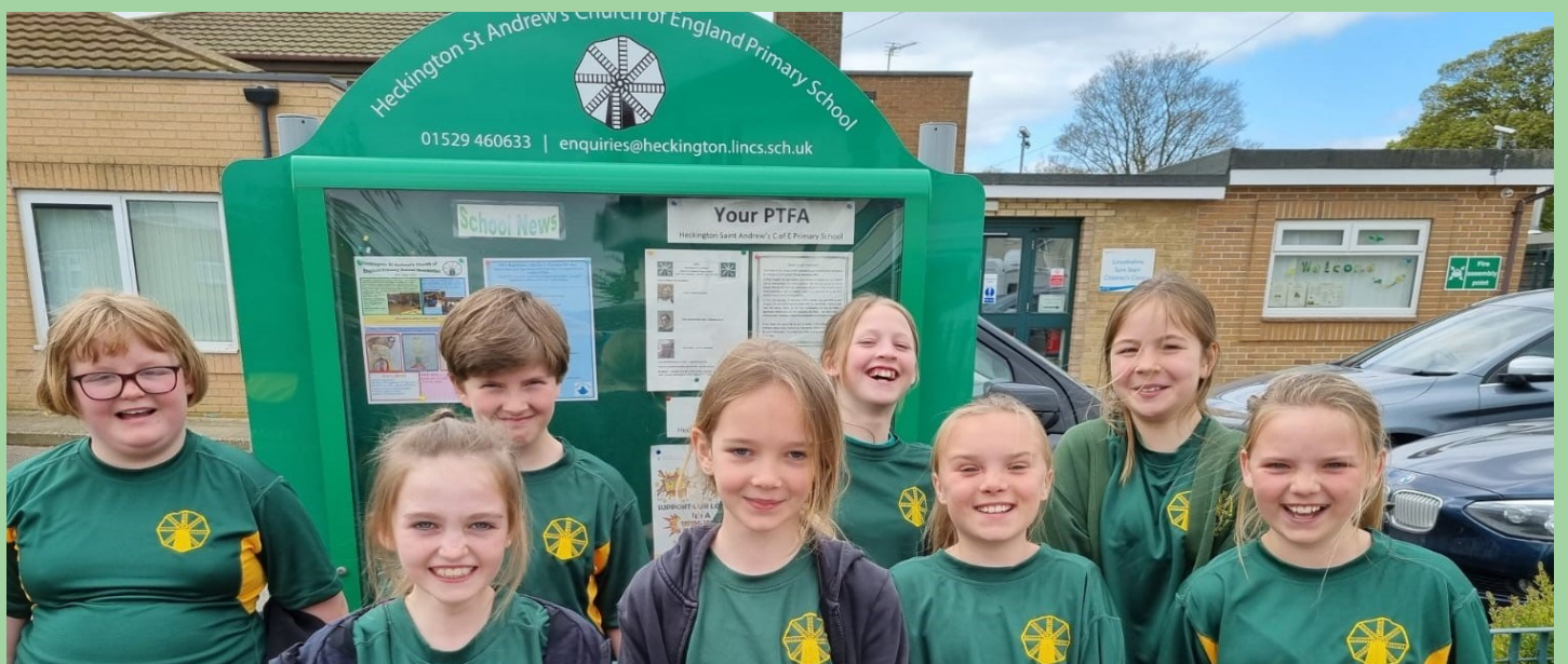
Dynamo Cricket team at Sleaford Cricket club