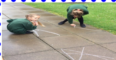
Year 4 Learning about angles using manipulatives