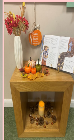
Our Harvest display.