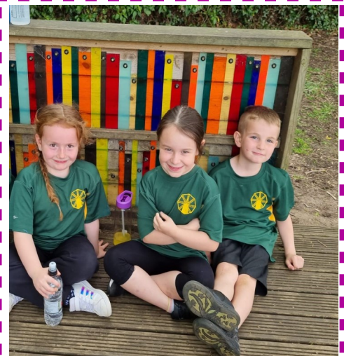
Trying out American Sports at a recent event