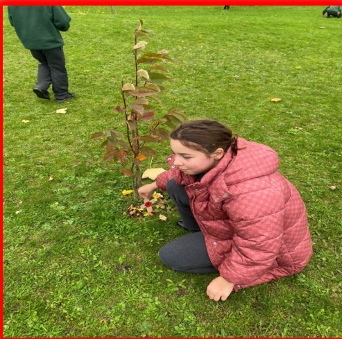
As part of the community Remembrance Day events, Hazel Class were invited by the Parish Council to visit the Arboretum in Heckington, to place the crosses at the bases of the trees. They were very respectful and behaved impeccably!