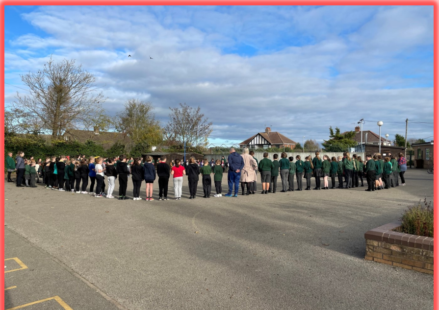
Our whole school Act of Remembrance