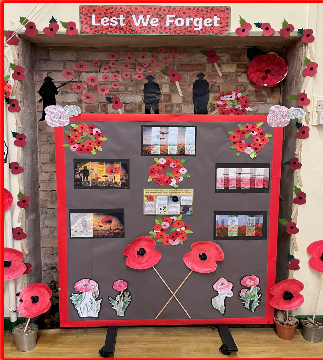
Each class have been learning about the importance of Remembrance Day. They have done some beautiful work to reflect this for our display.